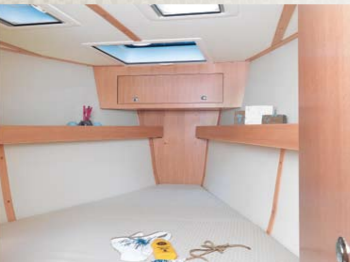
The semi deck saloon opens out into spacious L-shaped chef's galley, relaxing U-shaped lounge area to port and an abundance of storage throughout.