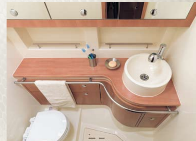
The selection of various interior layouts with up to 5 beautifully appointed cabins and large en-suite bathrooms offer the owner the possibility to custom design.