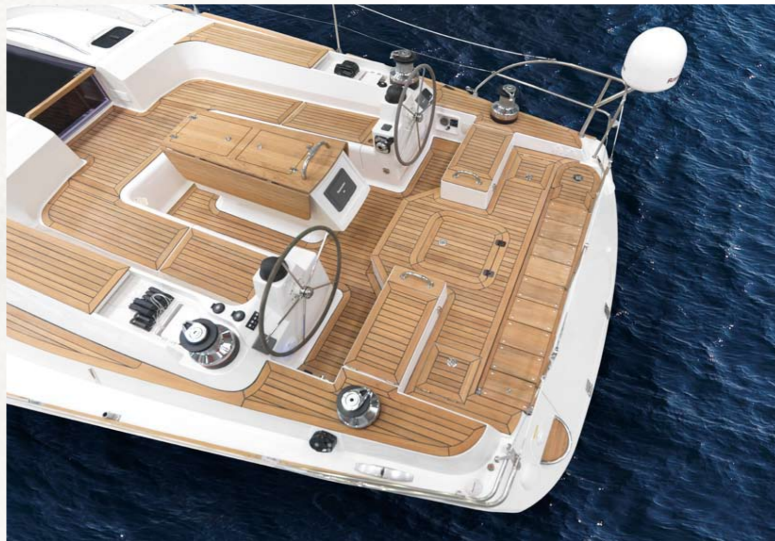
On deck the vast cockpit area provides excellent comfort, the twin wheel steering system offers both a perfect position for the helmsman and excellent access to the transom. Ergonomically positioned winches are designed for easy handling with minimum crew.